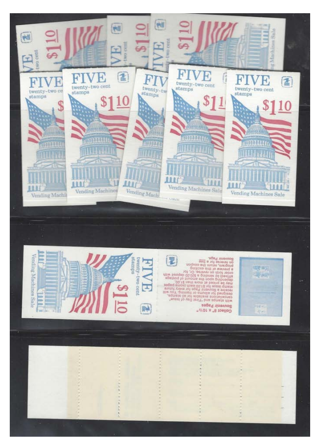
Lot 119 ** TEST BOOKLETS , #TDB32 (x 10), Each with Unprinted Pane of 5 Stamps (Dull Gum), MNH, VF Cond. (1985 Issue) Photo Cat. $175.00 Realized $28.00.

On May 13, 2017 Modern Stamps, Inc. held Sale #456 that contained the following test stamps. There is no Buyer's Premium for this sale.