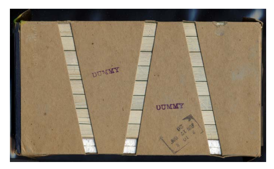
Photo of a full box of 240 - TDB12a Dummy Booklets Showing two red-violet " DUMMY " handstamps and black Inspector's handstamp B 10 B with a Jun 17, 1966 date. and 26 .