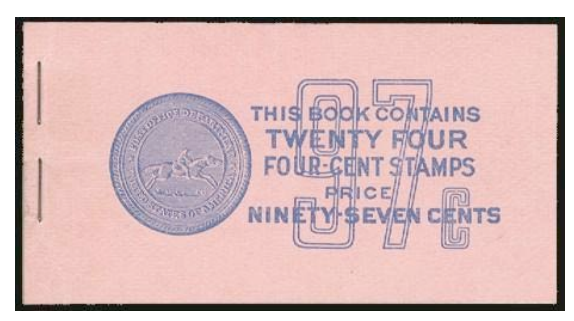
Lot 3917 TDB5, TEST BOOKLET, 1959 blue on pink 97¢. F-VF, NH Photo. Cat 175.00 Realized $70.00