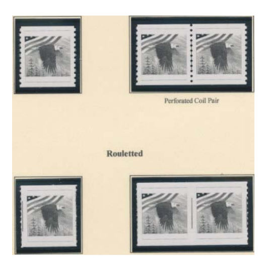
Lot 1436 * TEST STAMPS - NICE SPECIALIZED COLLECTION Photos. Suggested Bid...150-175 Price Realized Unknown.

On February 28 - March 1, 2012 R. Maresch & Son Auctions Ltd. held Public Auction #479 that contained the following test stamps. There is a 15% buyer's premium for this sale.