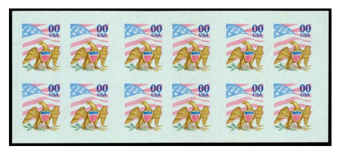
Lot 6536 Scott No. TDB80. Test Stamp, 1989, $3 multicolored, self adhesive (Scott TDB80), booklet pane of 12, o.g., never hinged, creases, Very Fine. Photo. Scott $1,500.00 Suggested Bid $700.00 Realized $450.00

Lot 6535 Scott No. TDB81. Test Stamp, 1989, $3 multicolored, shiny gum (Scott TDB81), booklet pane of 12, o.g., never hinged, surface scuff bottom left, Very Fine. Photo. Scott $2,250.00 Suggested Bid $1,100.00 Realized $1,400.00