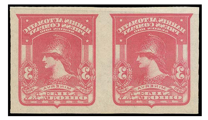
Lot 442 E 3c Minerva (Scott TD-29; Brazer, 385-E2b) , Harris Automatic Press Company, offset essay on hard white wove paper, pair, Superb, very Rare & seldom seen or offered. Photo. Est. $1,250 - $1,750.00 Realized $1,000.00

On May 3-5, 2013 James T. McCuster, Inc. held Sale #339 that contained the following test stamps. There is a 15% Buyer's Premium for this sale.