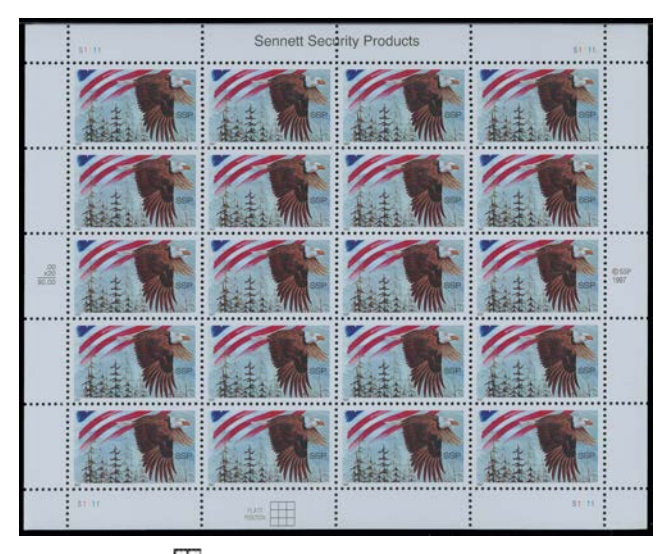
Lot 1786 * E Sennett Security Products Dummy Samples, sheet of 20 and coil strip of 9, NH, distributed at World Stamp Expo 2000, Very Fine Photo Est. $500.00 - $700.00 Realized $300.00

On June 6-8, 2013 H. R. Harmer, Inc. held Sale #3003 that contained the following test stamps. There is a 18% Buyer's Premium for this sale.